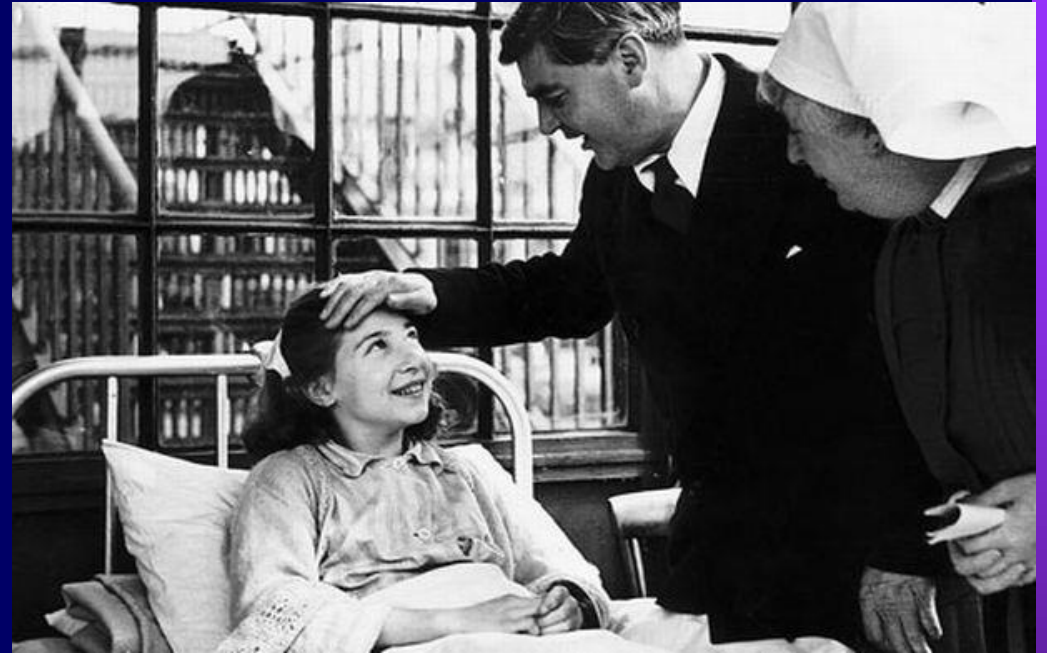
Aneurin Bevan Founder of the NHS