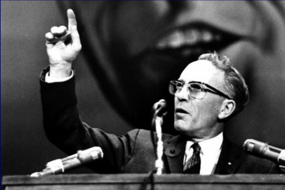
Tommy Douglas "Greatest ever Canadian"