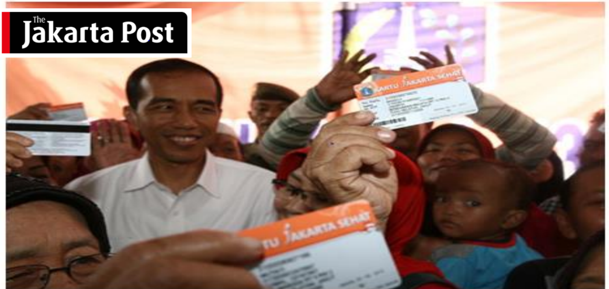
I got it!: Residents proudly display their free healthcare (KJS) cards while Jakarta Governor Joko "Jokowi" Widodo looks on during the distribution of the cards at a community health center in Koja, North Jakarta, on Tuesday.