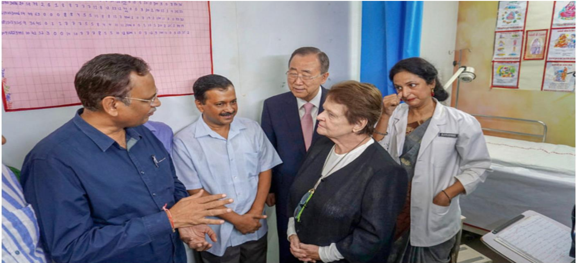
Former United Nations secretary-general Ban Ki-moon and former Norwegian prime minister Gro Harlem Brundtland with Delhi Chief Minister Arvind Kejriwal and Health Minister Satyendar Jain at a mohalla clinic